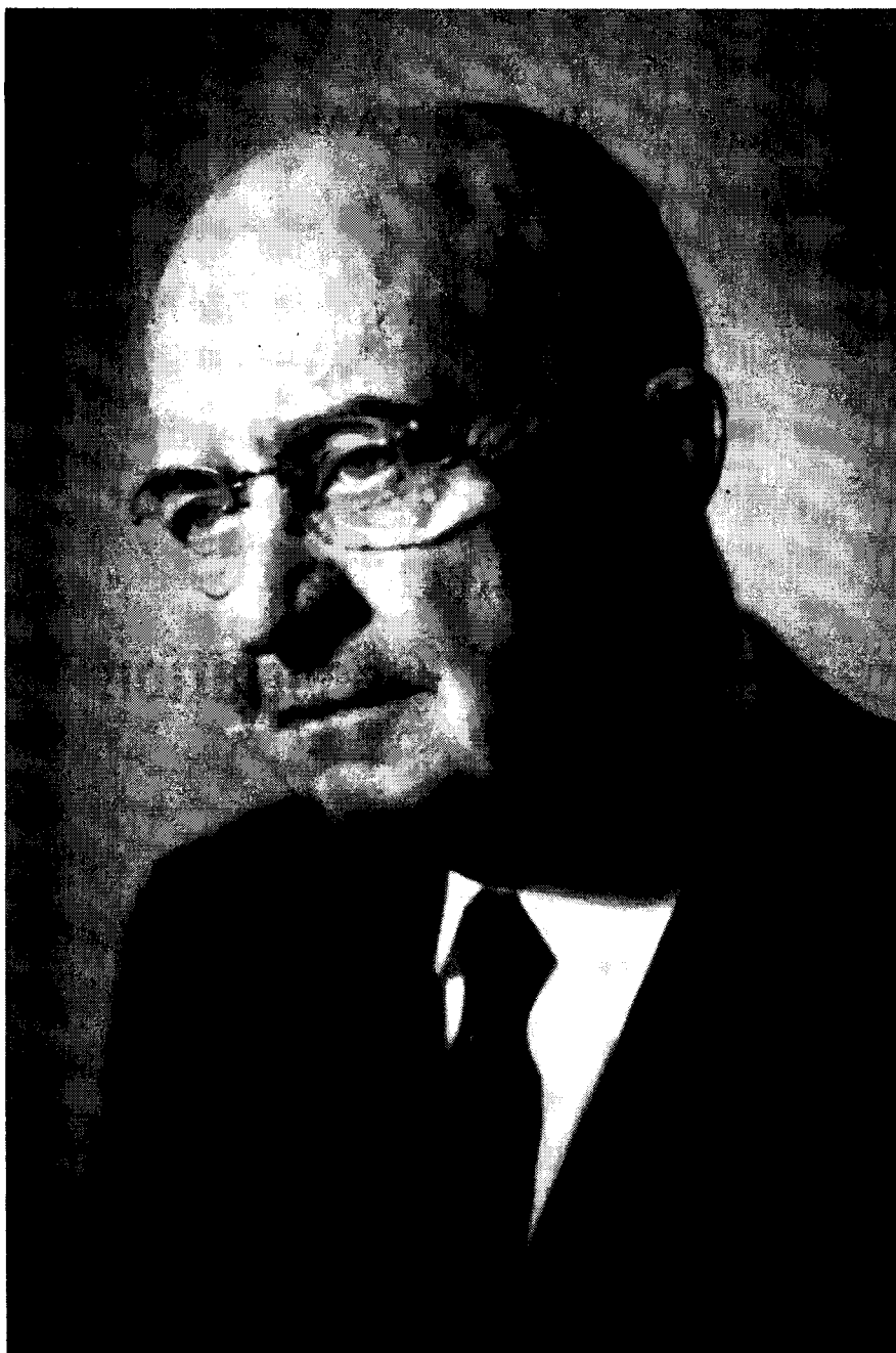
WALTER PRESCOTT WEBB Professor of History, University of Texas PRESIDENT OF THE AMERICAN HISTORICAL ASSOCIATION