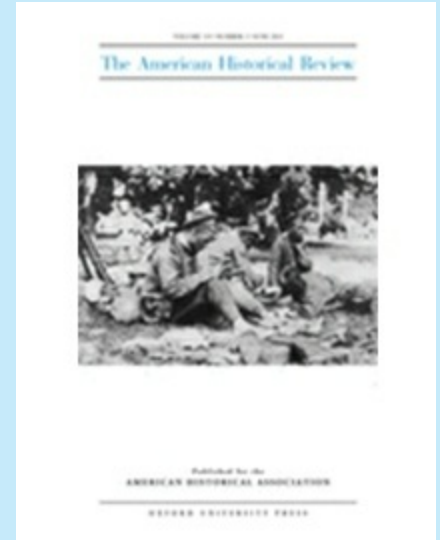
2019 MEDIA KIT

The American Historical Association (AHA) was founded in 1884 and chartered by Congress in 1889 to serve the interests of the entire discipline of history. Aligning with the AHA's mission, The American Historical Review has been the journal of record for the historical profession in the United States since 1895—the only journal that brings together scholarship from every major field of historical study. The journal also publishes approximately one thousand book reviews per year, surveying and reporting the most important contemporary historical scholarship in the discipline.